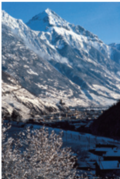
Martigny at the bend of the Rhone, Canton Valais. View of the Batiatz Tower ruin, with the Grand-Chavalard mountain rising in the background.